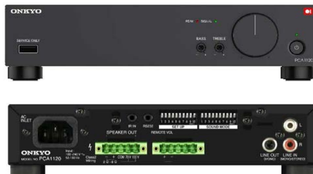
Mono Power Amplifier