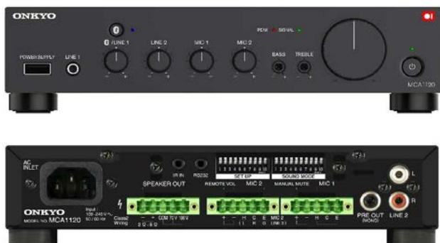
Mono Mixing Amplifier